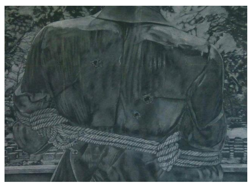
FEATURE: LOT 10

in cooperation with Artinformal Gallery and Art Circle Gallery