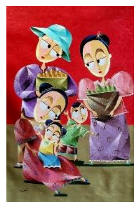
Lot 9 Family acrylic on canvas JOVAN BENITO 24 x 36 inches Starting bid: P65,000