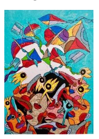
Lot 8 Kite Flyer pen, ink, acrylic on canvas MONNAR 24 x 18 inches Starting bid: P50,000