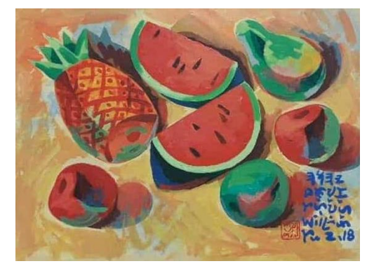
Lot 3 Still Life acrylic on canvas WILLIAM YU 18 x 24 inches Starting bid: P 86,000