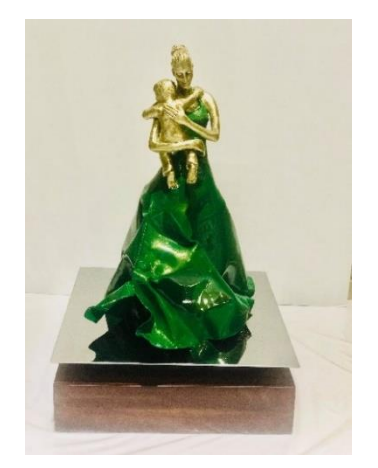
Lot 13 Unang Sayaw(in green) painted welded brass FERDINAND CACNIO 8 x 8 x 13 inches Starting bid: P140,000