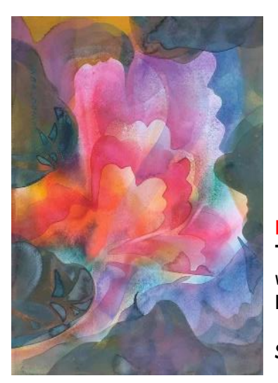
Lot 2 The Joy of Existence watercolor on paper MANUEL D. BALDEMOR Il x 15 inches Starting bid: P63,000