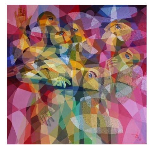
Lot 14 Conference at the Oracle Oil on canvas TITO ROLLY 40 x 40 inches Starting bid: P 80,000

Anton del Castillo (born in 1976 in Tondo, Manila, Philippines) is a multi-awarded and critically acclaimed Filipino visual artist known for the stunning craftsmanship and meticulous design of his artworks that meditate on critiques of modernism and contemporary life. His production of iconic and playful art objects such as sculptures produced in steel and paintings that resemble Byzantine icons, aside from other projects, have earned him recognition not only as an artist but as a master artisan and craftsman.