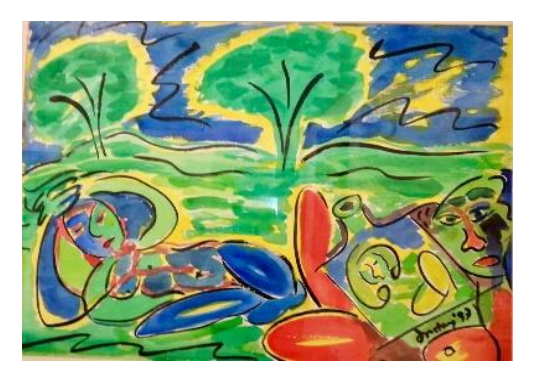
Lot 5 Nude watercolor on paper INDAY CADAPAN 22 x 30 inches Starting bid: P 110,000