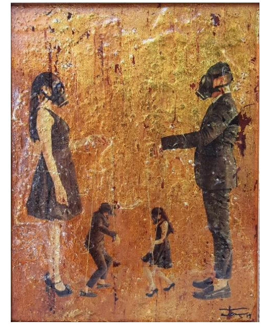
PEATURE: LOT 12 Duel ANTON DEL CASTILLO Oil over goldleaf 50 x 45 cm Starting bid: P 80,000