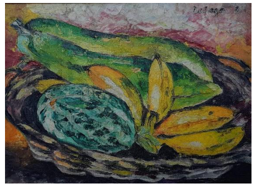
Lot 4 Still Life acrylic on canvas NORMA BELLEZA 10 x 12 inches Starting bid: P 80,000