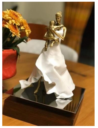
Lot II Unang Sayaw (in white) painted welded brass FERDINAND CACNIO 8 x 8 x 13 inches Starting bid: P140,000

in cooperation with Artinformal Gallery and Art Circle Gallery