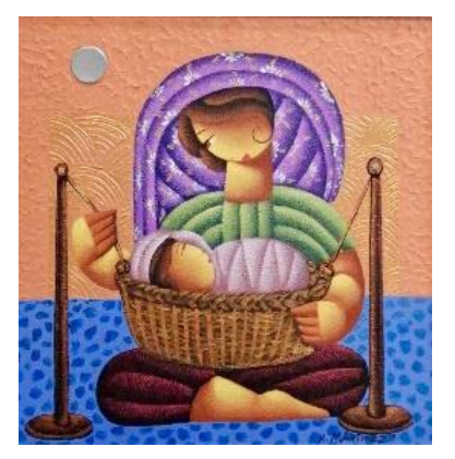
Lot 7 Duyan acrylic on canvas RAYMART MARTINEZ 15 x 15 inches Starting bid: P16,000